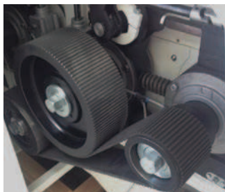
SKF FX keyless adapter sleeve